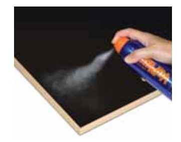
SPRAY PLASTIC POLISH